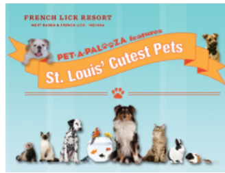
Vote For St. Louis' Cutest Pet!