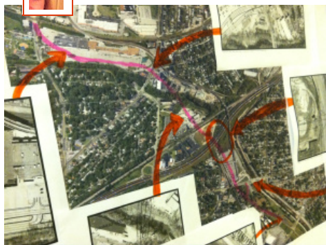
A board shows a prospective route for the proposed South County Connector on display at a Trailnet meeting on May 8, 2013.

ST. LOUIS (KMOX) - St. Louis aldermen are holding a public meeting Monday night to discuss the South County Connector road project.