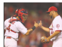
Baseball Shots Of The Week -...