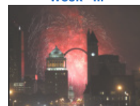
4th of July in St.