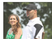
Pujols Charity Golf Tourney