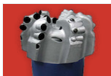
Buy HOT Shares and Invest in USA's Future