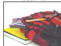
Must-Have School Supplies