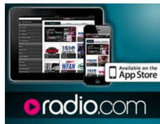
Get The App