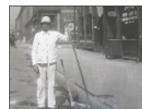
New Photos Of Old St. Louis