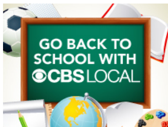
Back To School Ideas