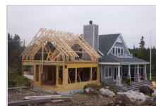
Should You Really Renovate?