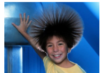
Top Exhibits To Visit This Summer