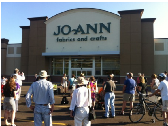
A group met at Maplewood's Deer Creek Center to protest the South County Connector.